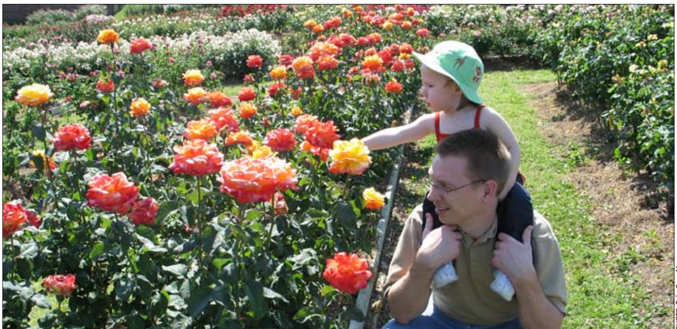
Tyler Municipal Rose Garden

Since January 2008, the Comptroller has released three reports in the Texas in Focus