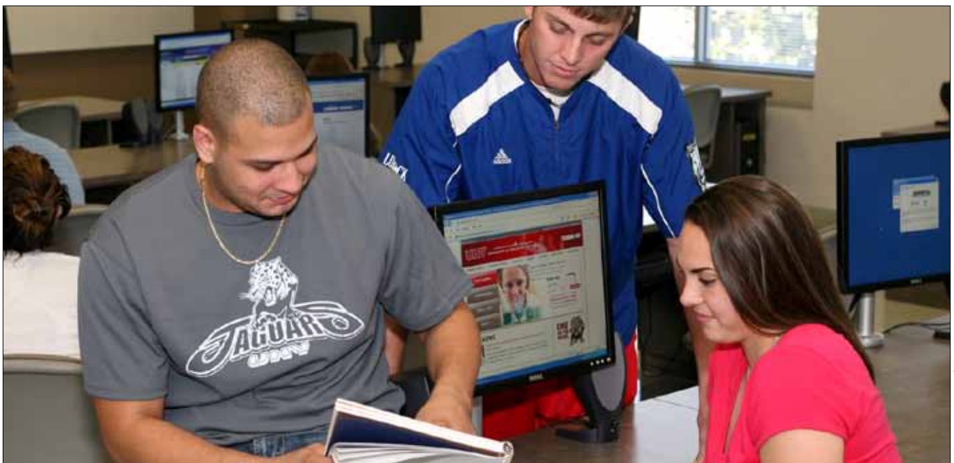
University of Houston-Victoria

About 9.4 percent, or more than 435,000 of the state's public elementary and secondary students, attend school in the Alamo region.