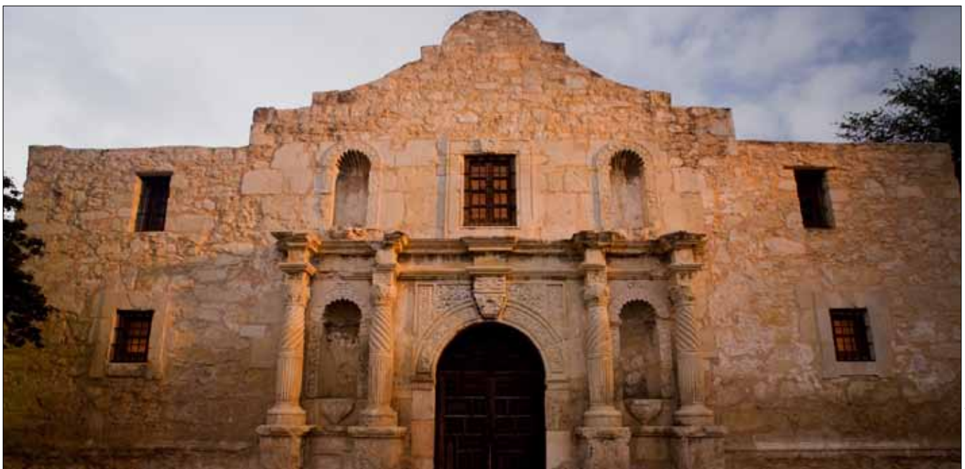
The Alamo, San Antonio

This seventh report in the series, Texas in Focus: Alamo Region , examines issues